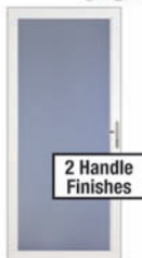
2 Handle Finishes

$32 95 Brushed Nickel Brass Aged Bronze Antique Brass