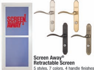
Screen Away® Retractable Screen 5 styles, 7 colors, 4 handle finishes