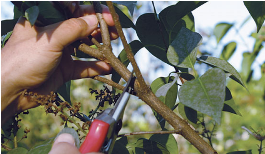
Removing stems: Remove diseased, misshapen, and unproductive stems to clear the way for new, healthy stems. Old stems become less and less productive and, if not grafted, should be cut back to the ground. New shoots and suckers should be thinned out to keep them properly spaced around the shrub.